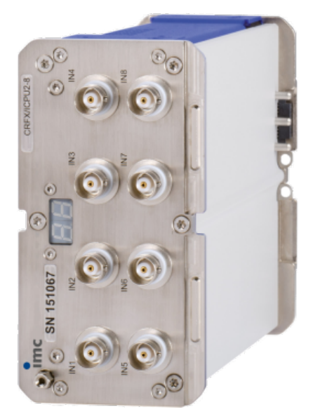
imc CRONOSflex IEPE/ICP Measurement Module (CRFX/ICPU2-8)